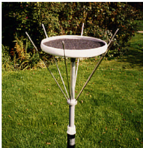
Figure 2 Position of bird strike preventor and supporting struts

4.1 Pre-weigh (to the nearest 0.1 mg) a 9-cm diameter Whatman GF/A glass microfibre filter after drying it on a watch glass (or glass Petri dish) in an oven for 1 hour at 80°C and equilibrating for 2 hours in a desiccator. (Use tweezers when picking up filters and do not place filters directly onto unclean surfaces).